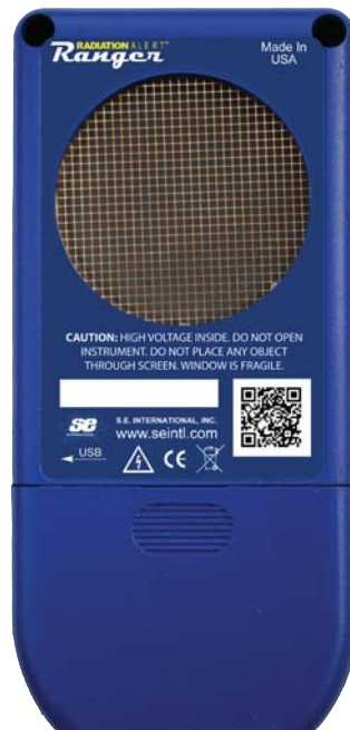
Detector Window and AA Battery Door on Back