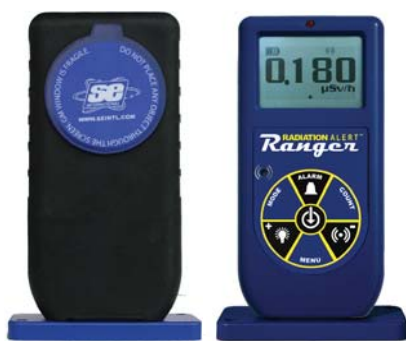
Lanyard, Ruggedized Boot, Detector Cover, USB Cable and Stand Included