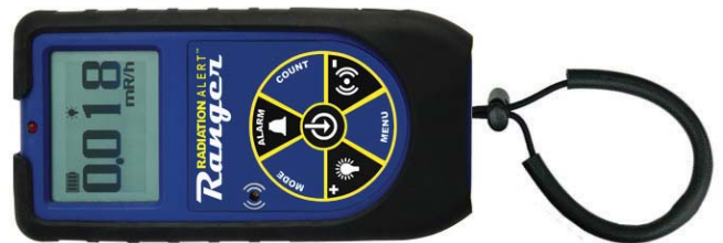
Shown with ruggedized protective boot