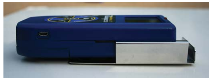
Optional Wipe Test Plate Shown